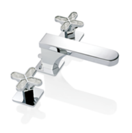
A6G.151 Rim mounted 3-hole basin mixer