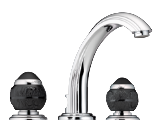
A2K.151 Rim mounted 3-hole basin mixer