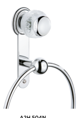
A2H.504N Single towel ring