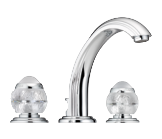
A2H.151 Rim mounted 3-hole basin mixer