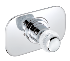
A2H.5100B Trim for thermostat