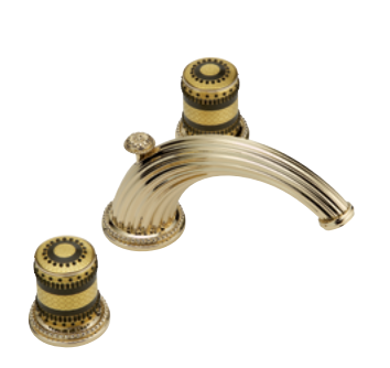
U8B.151 Rim mounted 3-hole basin mixer