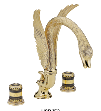
U8B.152 Rim mounted 3-hole basin mixer - high spout