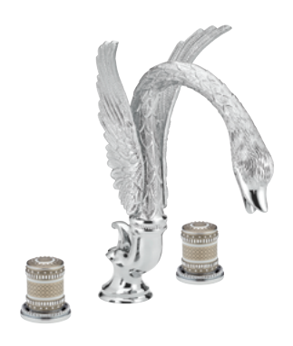
U8C.152 Rim mounted 3-hole basin mixer - high spout