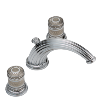
U8C.151 Rim mounted 3-hole basin mixer