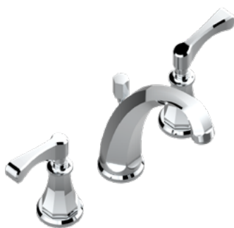
A55.152 Rim mounted 3-hole basin mixer - high spout Metal - levers