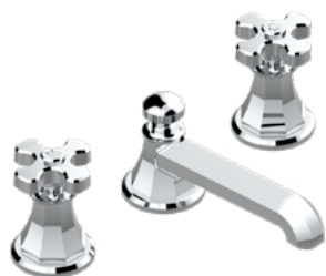
A54.151 Rim mounted 3-hole basin mixer Metal - cross handles