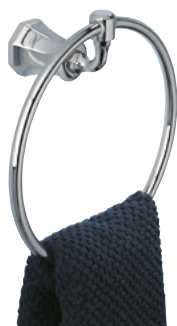
A54.504N Single towel ring