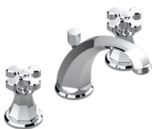
A54.152 Rim mounted 3-hole basin mixer - high spout Metal - cross handles