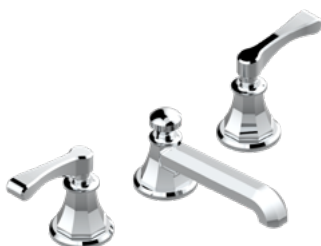
A55.151 Rim mounted 3-hole basin mixer Metal - levers