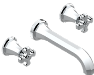
A54.41SG Wall mounted 3-hole bath mixer