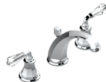
A56.152 Rim mounted 3-hole basin mixer - high spout Metal - crystal levers