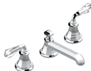
A56.151 Rim mounted 3-hole basin mixer Metal - crystal levers