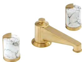
G2H.151 Rim mounted basin mixer