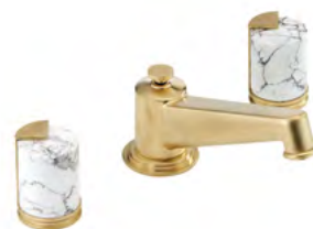
G2H.152 Rim mounted basin mixer - high spout