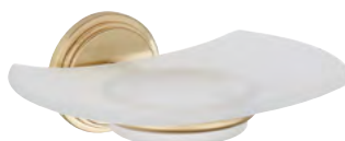
G2H.500 Soap dish