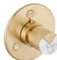
G2H.48M2SB Trim for diverter