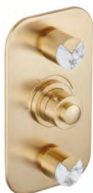
G2H.5400BE Trim for thermostat