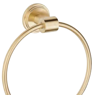
G2H.504N Towel ring