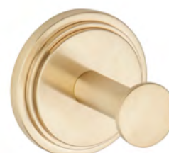
G2H.517 Robe hook