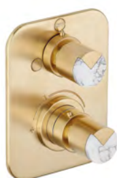
G2H.5500BE Trim for thermostat