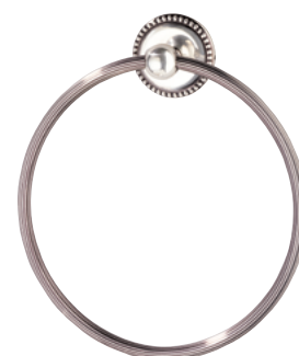
G14.504N Single towel ring