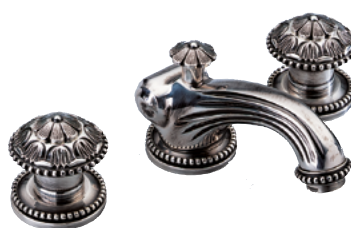
G14.151 Rim mounted 3-hole basin mixer