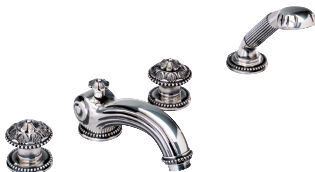
G14.112BG Rim mounted 4-hole bath-shower mixer