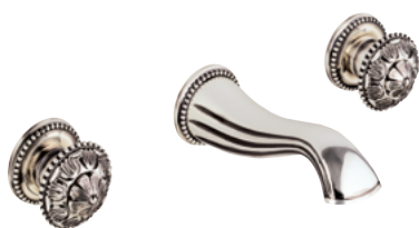
G14.40G Wall mounted 3-hole basin mixer