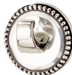
G14.508 Robe hook