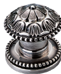
G14.103 Focus on the handle