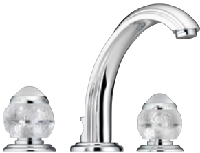
A2H.151 Rim mounted 3-hole basin mixer