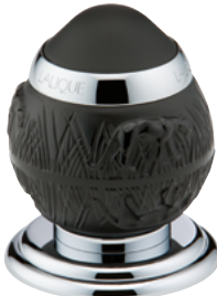
Focus on the handle