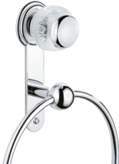
A2H.504N Single towel ring