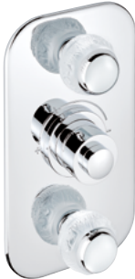
A2H.5400BE Trim for thermostat