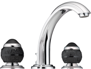
A2K.151 Rim mounted 3-hole basin mixer