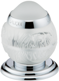
Focus on the handle