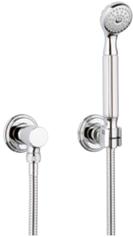
A2H.52 Wall mounted handshower set