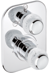
A2H.5500BE Trim for thermostat