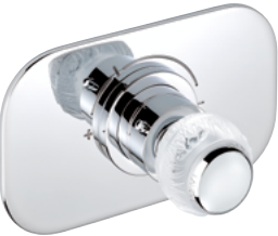
A2H.5100B Trim for thermostat