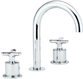
G7F.152 Rim mounted basin mixer - high spout