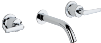
G7G.41SG Wall mounted bath mixer