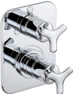
G7F.5500BE Trim for thermostat