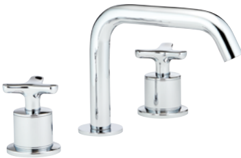
G7F.151 Rim mounted basin mixer