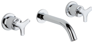
G7F.41SG Wall mounted bath mixer