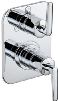
G7G.5500BE Trim for thermostat