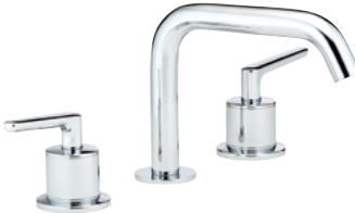
G7G.151 Rim mounted basin mixer