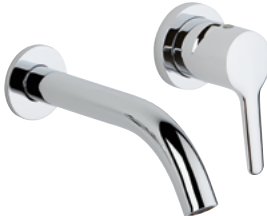
G7F.6541 Wall mounted basin mixer