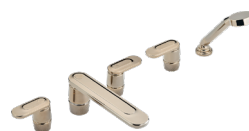
U8E.1132SG.H66 Rim mounted bath mixer and handshower set