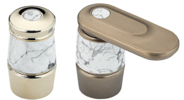
CORVAIR HOWLITE U8F Howlite / U8G Howlite - levers