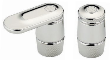
CORVAIR METAL U8D Metal / U8E Metal - levers