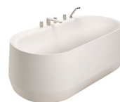
B11.B531.AS2 Free standing bathtub