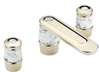
U8F.151.F30 Basin mixer