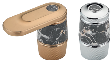
CORVAIR PORTORO U8H Portoro / U8J Portoro - levers