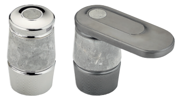
CORVAIR FIOR DI BOSCO U8K Fior di Bosco / U8G Fior di Bosco - levers