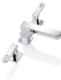
A6H.151 Rim mounted 3-hole basin mixer