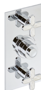
A6G.5400BE Trimmings for thermostat