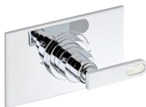
A6H.5100B Trimmings for thermostat