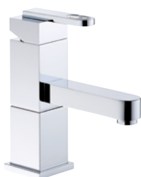
A6H.6500 Single lever basin mixer