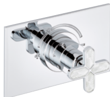
A6G.5100B Trimmings for thermostat