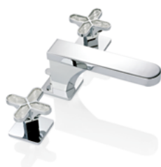
A6G.151 Rim mounted 3-hole basin mixer