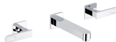
A6H.40G Wall mounted basin set