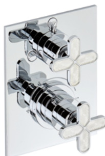
A6H.5100B Trimmings for thermostat