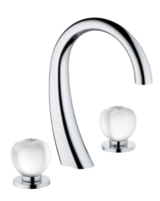
A42.151 Rim mounted 3-hole basin mixer