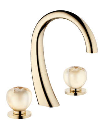
A46.151 Rim mounted 3-hole basin mixer