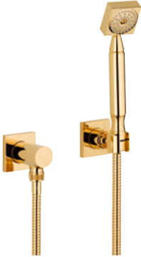
U5E.52 Shower set