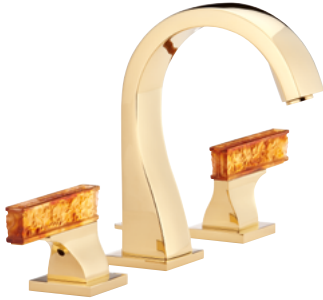
U5E.151 Rim mounted 3-hole basin mixer