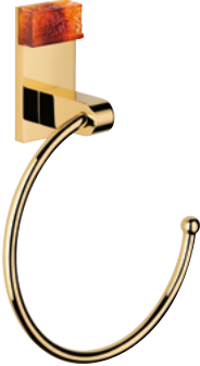
U5E.504N Single towel ring