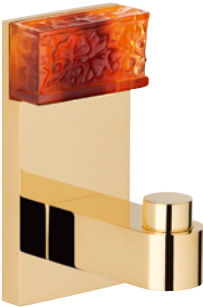
U5E.517 Robe hook