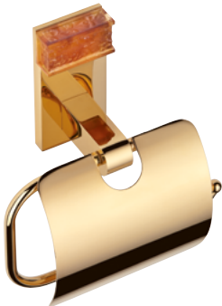
U5E.538AC Wall mounted WC paper holder