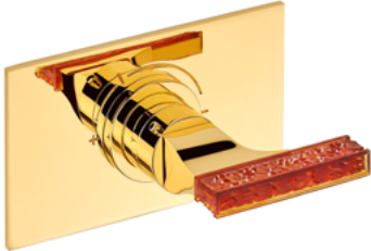
U5E.5100B Trim for thermostat