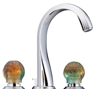
U5A.151 Rim mounted 3-hole basin mixer