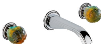
U5A.40G Wall mounted 3-hole basin mixer