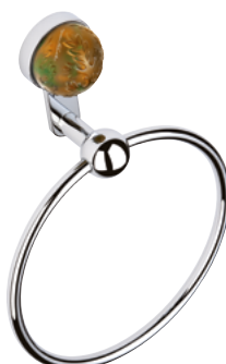
U5A.504N Single towel ring