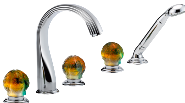
U5A.1132SG Rim mounted 4-hole bath-shower mixer