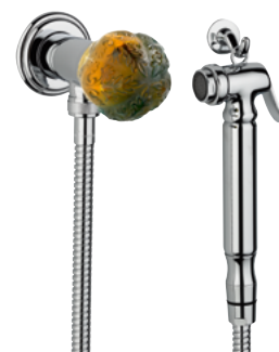
U5A.5840/8 Hygienic set