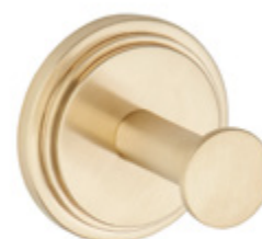
G2H.517 Robe hook