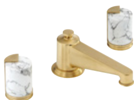
G2H.151 Rim mounted basin mixer