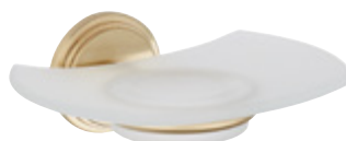
G2H.500 Soap dish