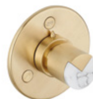
G2H.48M2SB Trim for diverter