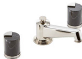
G2i.152 Rim mounted basin mixer - high spout