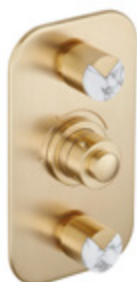
G2H.5400BE Trim for thermostat