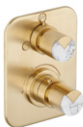
G2H.5500BE Trim for thermostat